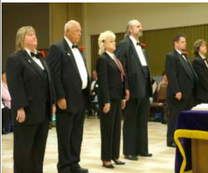
2008-2009 Officers Installation