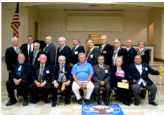
03-18-08 New Members Initiated